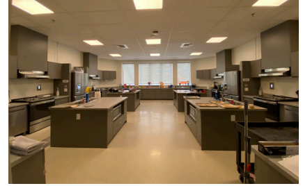
Above: Family & Consumer Science Classroom