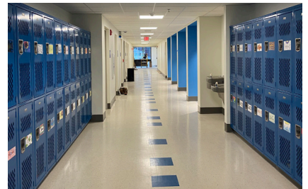
Above: Renovated 2nd floor corridor of existing school.