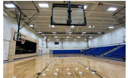
Above: Gymnasium and Stage.