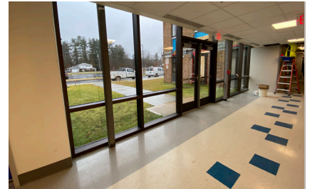
Above: Location of former main entrance vestibule.